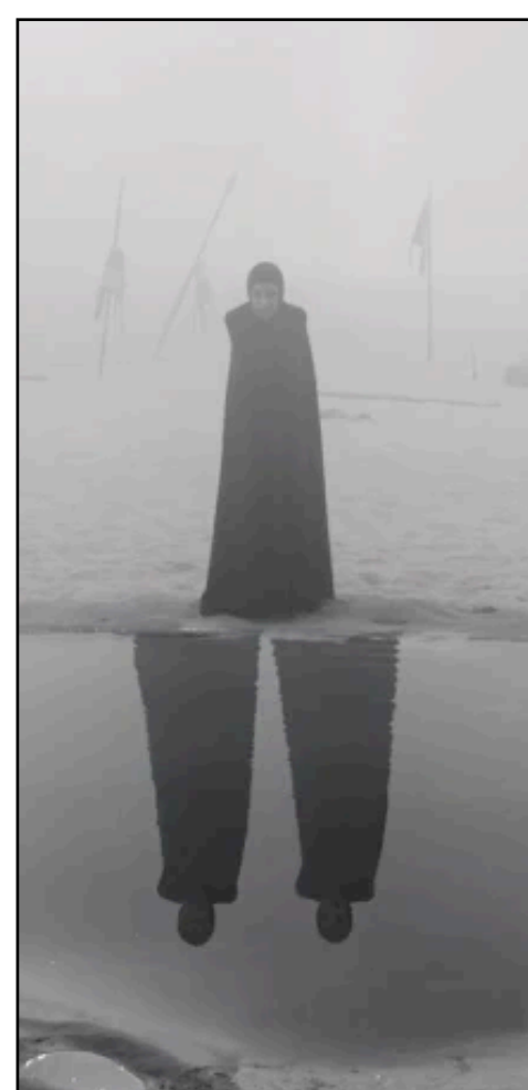
THE TRAGEDY OF MACBETH