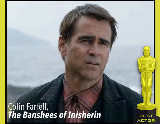
Colin Farrell, The Banshees of Inisherin