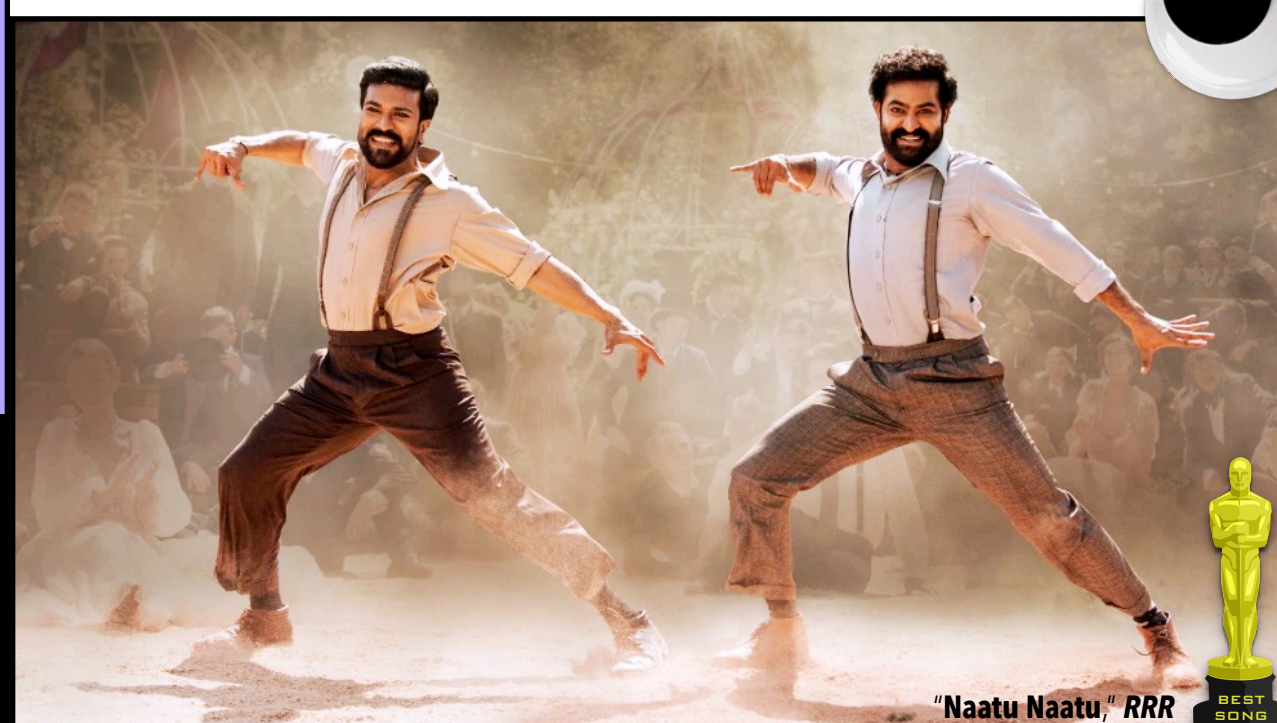
"Naatu Naatu," RRR