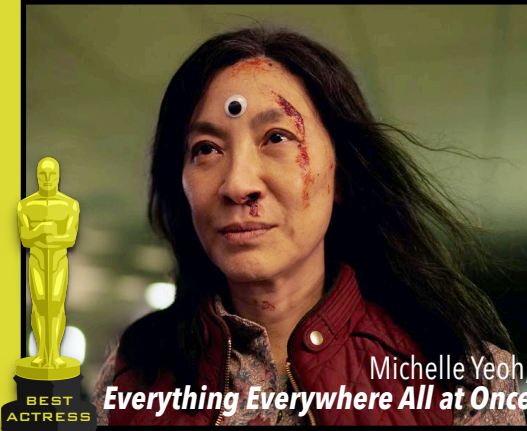
Michelle Yeoh, Everything Everywhere All at Once